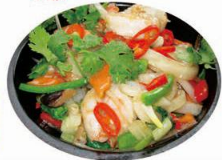
Stir Fried King Prawns in Claypot

Some of our dishes contain ingredients which some people may have a reaction to. Please inform our staff before ordering if you suffer from any food allergies. We will do our best to advise you.