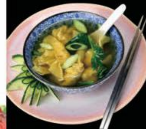
Won Ton Soup

Some of our dishes contain ingredients which some people may have a reaction to. Please inform our staff before ordering if you suffer from any food allergies. We will do our best to advise you.