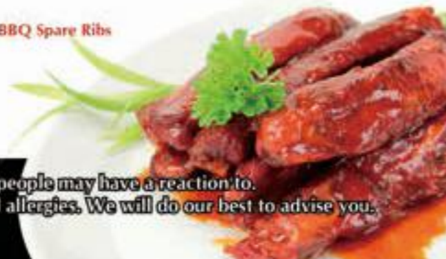
BBQ Spare Ribs