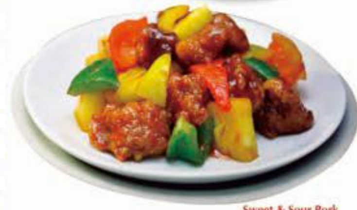
Sweet & Sour Pork

Some of our dishes contain ingredients which some people may have a reaction to. Please inform our staff before ordering if you suffer from any food allergies. We will do our best to advise you.