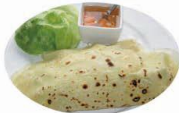
Vietnamese Pan Fried Pancake with King Prawns