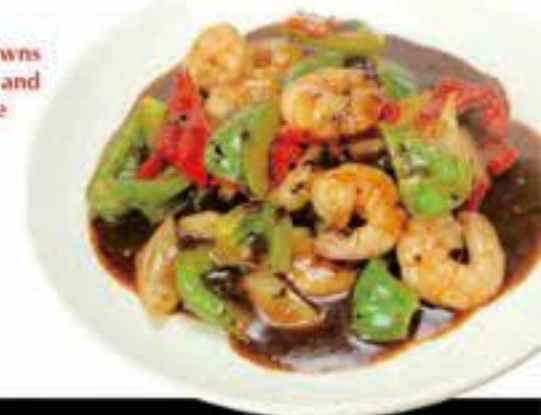
Sizzling King Prawns in Green Pepper and Black Bean Sauce

Some of our dishes contain ingredients which some people may have a reaction to. Please inform our staff before ordering if you suffer from any food allergies. We will do our best to advise you.