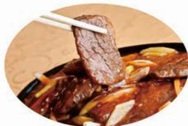
Sizzling Fillet Steak Cantonese Style