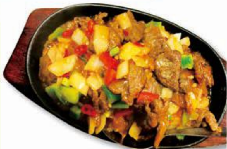
Sizzling Beef Garlic & Chilli ✔