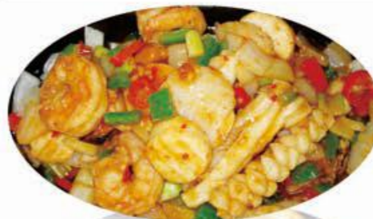
Sizzling Seafood in Garlic & Chilli Sauce