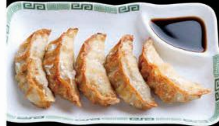
Pan Fried Pork Dumpling with Vinegar Sauce