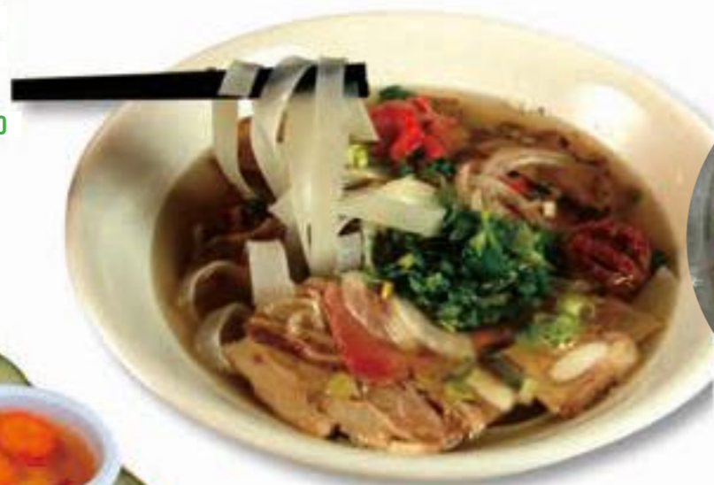
Special Noodle Soup