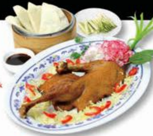
Aromatic Crispy Duck with Pancakes