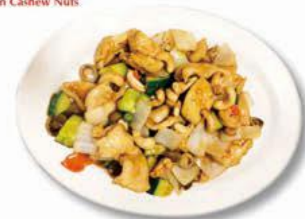
Chicken Cashew Nuts