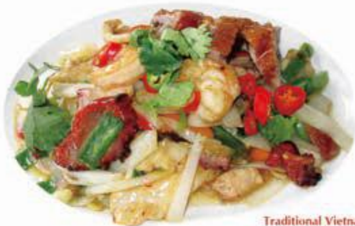
Traditional Vietnamese Stir Fry House Special