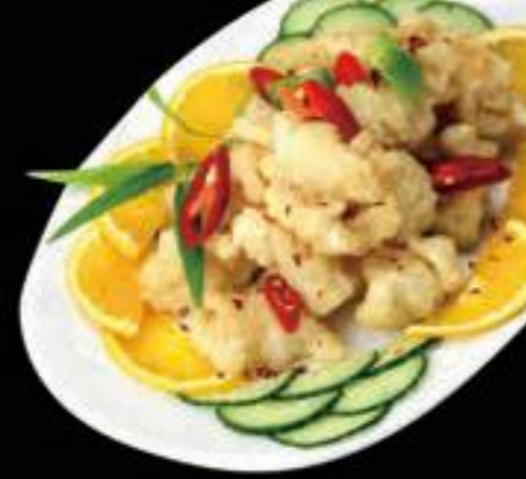
Salt & Pepper Squid