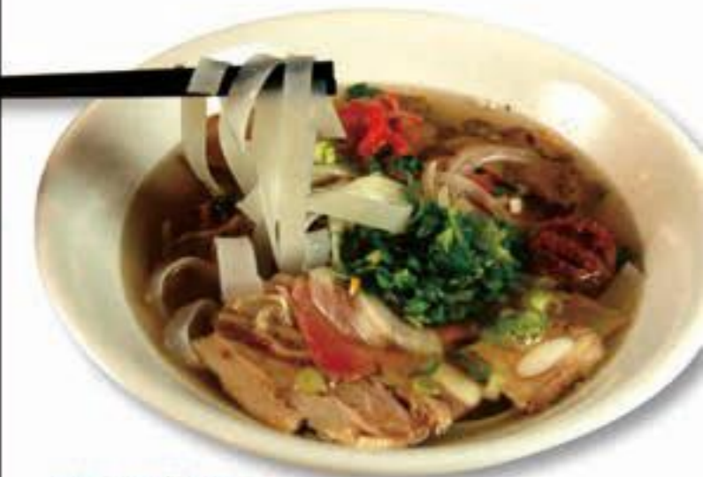
Special Noodle Soup