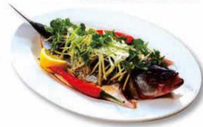
Sea Bass in Vietnamese Style Steamed

Some of our dishes contain ingredients which some people may have a reaction to. Please inform our staff before ordering if you suffer from any food allergies. We will do our best to advise you.