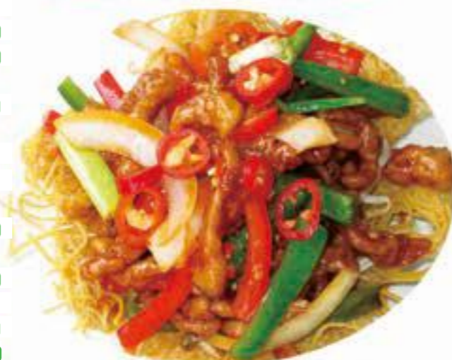
Shredded Crispy Beef in Spice & Chilli Sauce

Some of our dishes contain ingredients which some people may have a reaction to. Please inform our staff before ordering if you suffer from any food allergies. We will do our best to advise you.