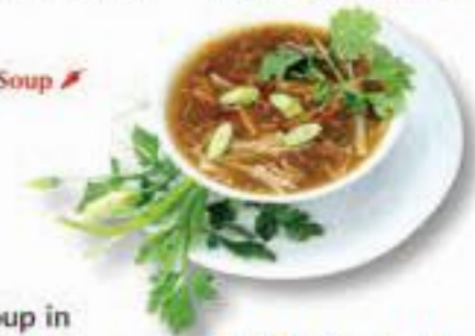
Peking Hot and Sour Soup